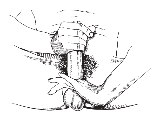
FIGURE 9. SCROTAL TUG

Many sexologists recommend squeezing the penis, a technique that was originally developed for men who ejaculate "prematurely." It is simple. Just place the first two fingers of either hand on the underside of your penis, place your thumb on the top, and squeeze (see figure 8a). Some men also find that gripping their penis like the handlebar of a bicycle and pressing down on the tip or underside with their thumb helps them reduce their arousal (see figure 8b). Although these techniques can be effective in solo practice, they are awkward when having intercourse because you must withdraw. To prepare for this situation, you can try using your mind to help squeeze the tip of your penis. Eventually, you will be able to squeeze the tip of your penis with just your mind and will avoid the clumsiness of having to use your hands. Another good technique is squeezing at the base of your penis (remembering to also squeeze with your mind). This will help you control your arousal and will also expand and strengthen your erections (see figure 8c).