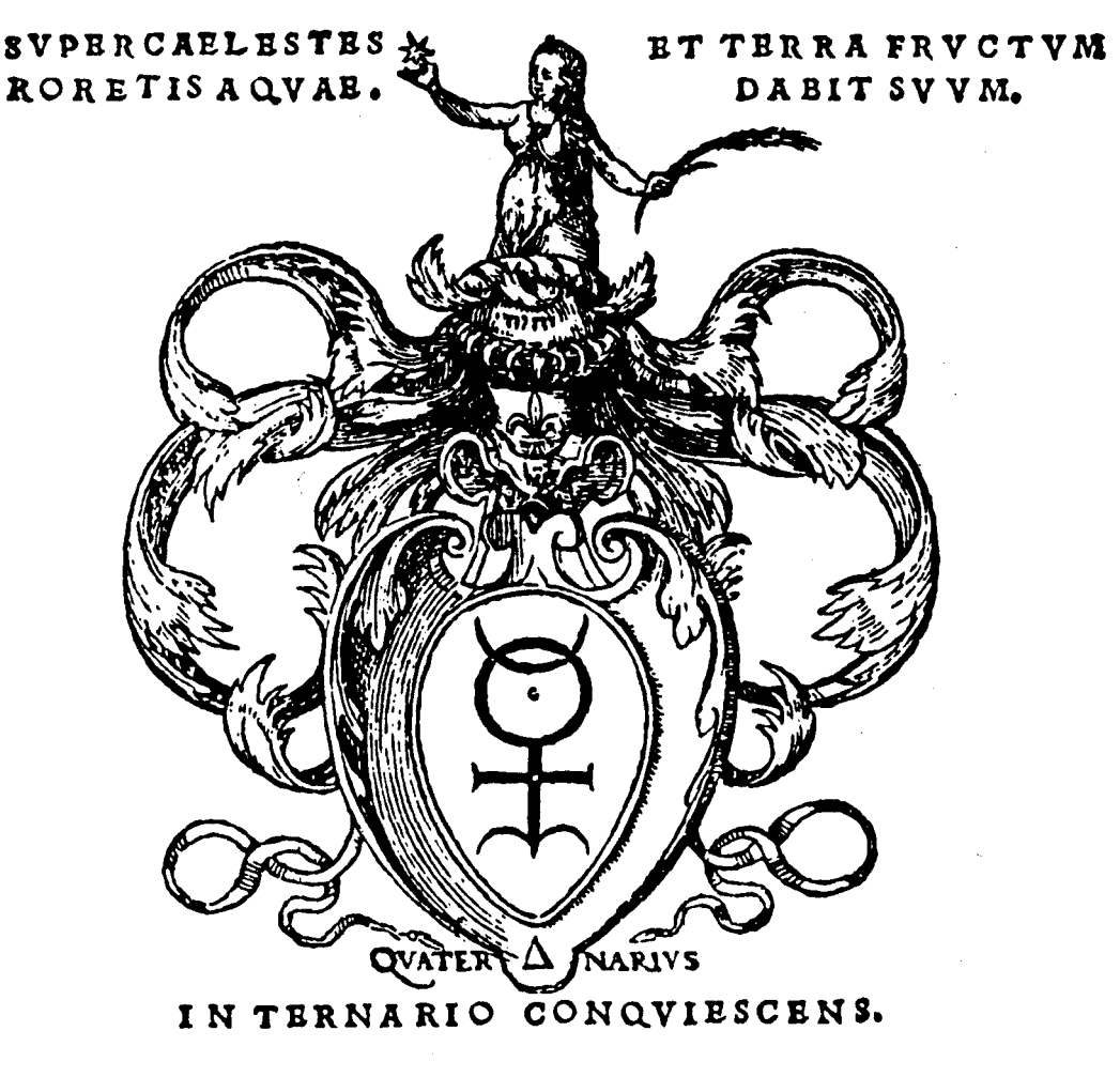
figure of Virgo - the zodiacal sign ruled by mercury - who has caught the star in her left hand and thus become fertilized or imbued with dew. Thus she is visibly pregnant and holds an ear of corn. Traditionally Virgo was often depicted holding an ear of corn which germinated to become the Milky Way, and here it is a symbol of the wealth produced by the fatness of the land in such scriptural verses that are related to the mottos of these two emblems.

We have seen that the Monad is ammenable to alchemical allegory and itself is apparently related to the Philosophers Stone as a bestower of health and of spiritual enlightenment. In Agrippa's chapter on the Monad in De occulta philosophia one sentence stands out as a lone piece of obscurity amongst the rest of the perhaps oversimplified text.